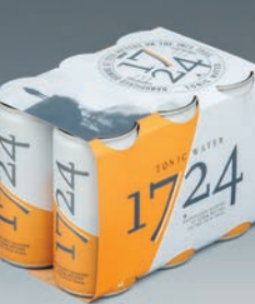
Sleeve (2 x 3)