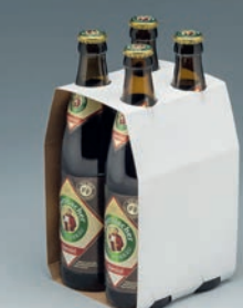
Sleeve (2 x 2)