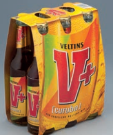
Sleeve (2 x 3)