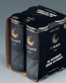
Sleeve (2 x 2)