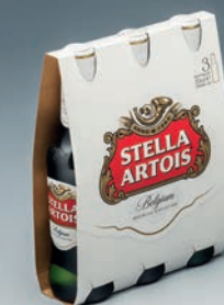
Sleeve (1 x 3)