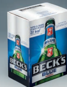
Fully enclosed pack