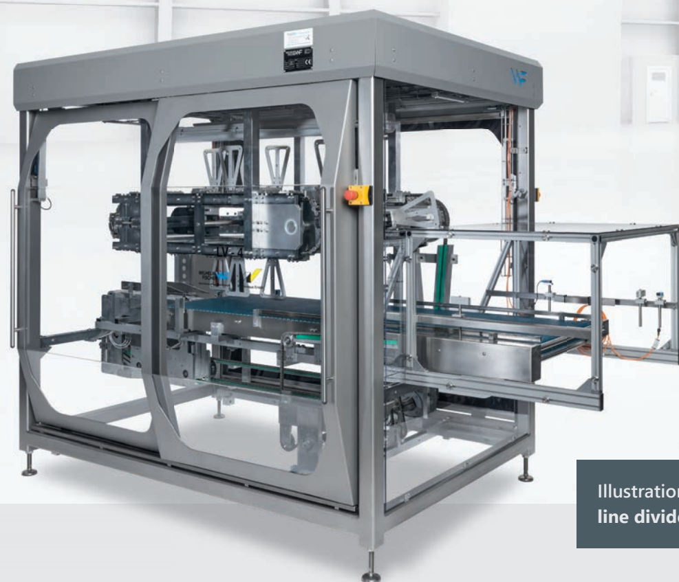
Illustration shows a line divider